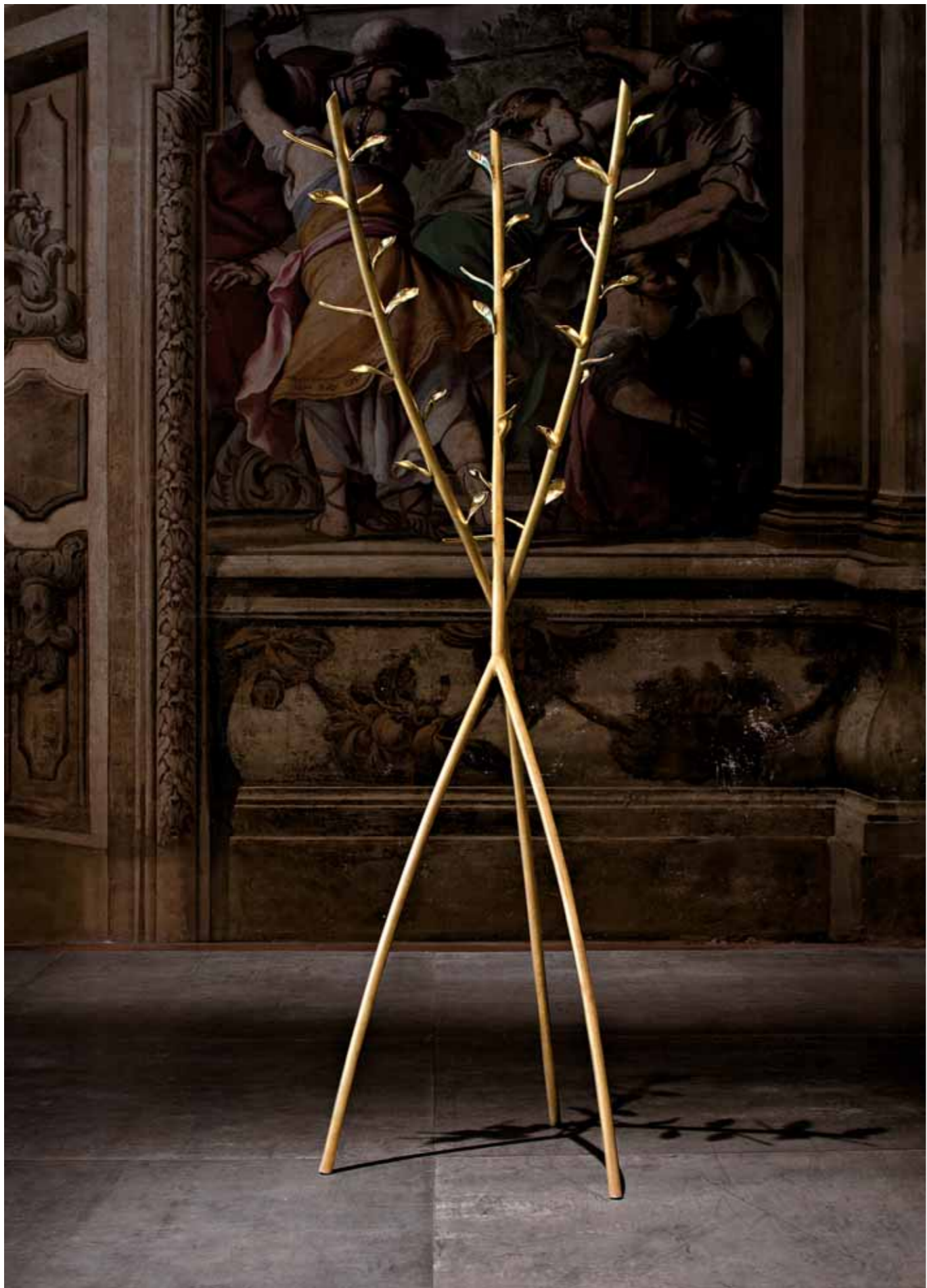
ACATE by Borek Sipek