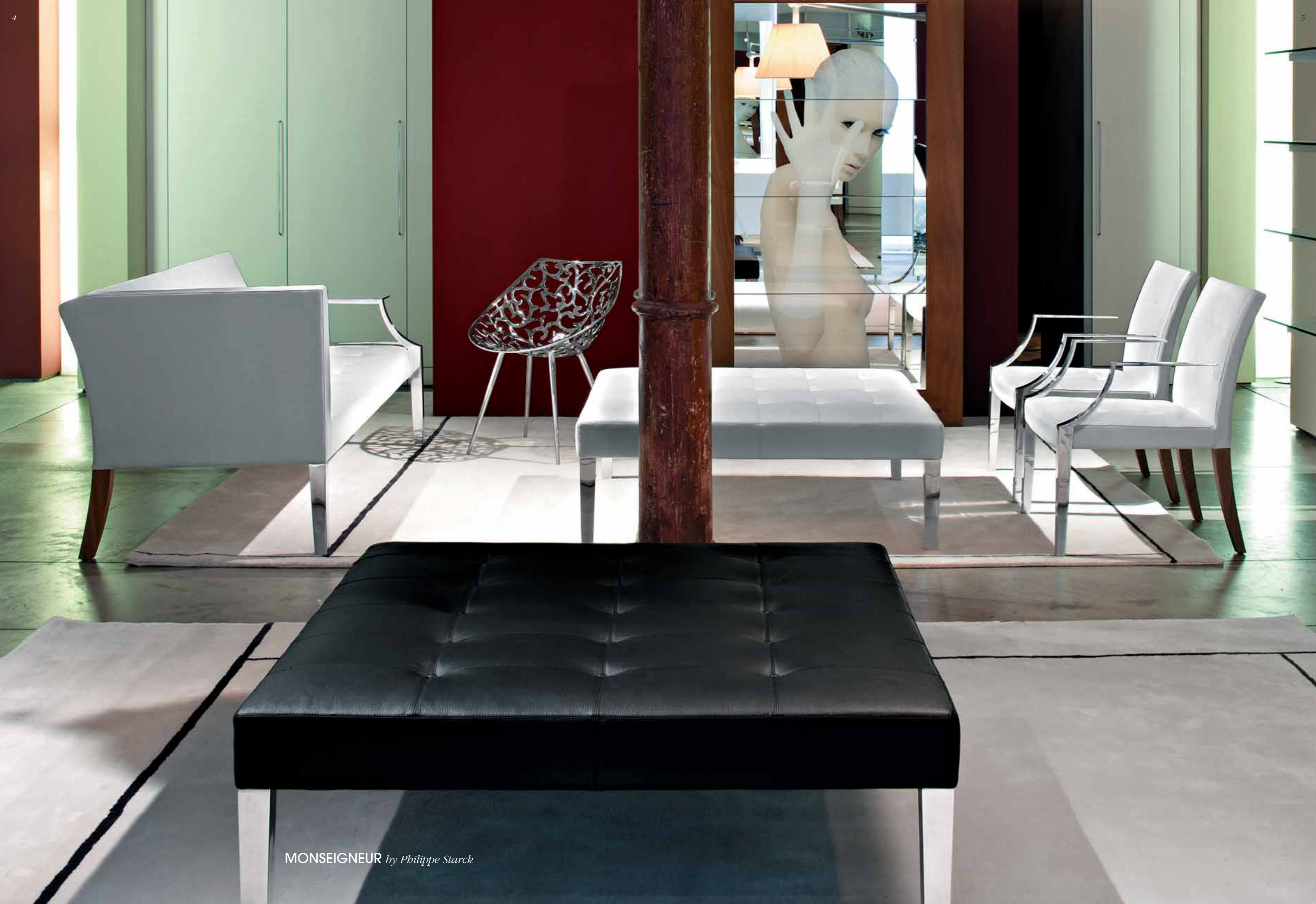
MONSEIGNEUR by Philippe Starck