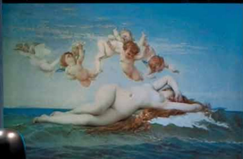
Alexandre Cabanel Naissance de Venus 1863