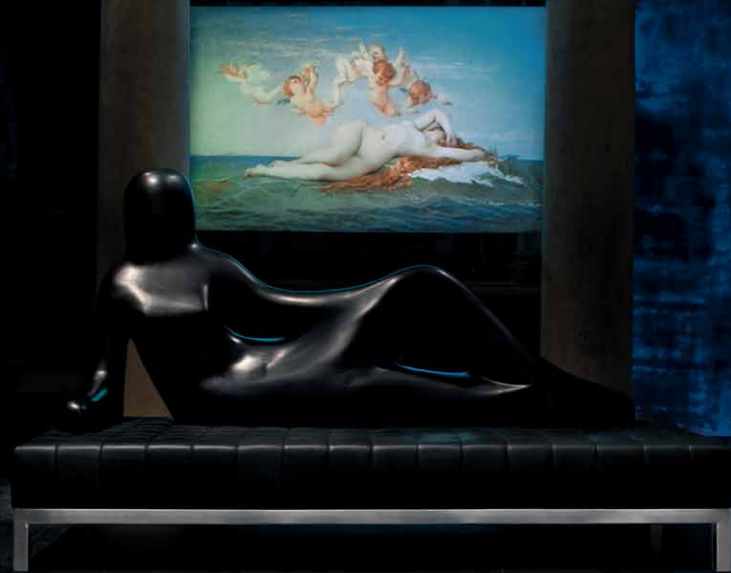
DIVINA by Fabio Novembre